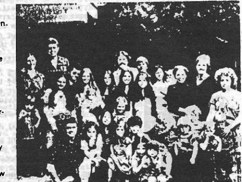
Family get-together in Spain! Sorry, no names given. Recognise anyone?