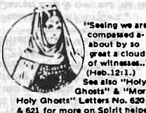
"Seeing we are compassed about by so great a cloud of witnesses." (Heb. 12:1.) See also "Holy Ghosts" & "More Holy Ghosts" Letters No. 620 & 621 for more on Spirit helpers!

I KEPT GETTING A VISION OF A BOOK, a Bible-like book & just then the Lord's voice spoke to my heart to "open up the book", which I couldn't understand as I had come in empty-handed. But there among 40 vacant desks in a silent classroom was a conspicuous paperback book about the size of a Bible & I felt a great urge to open it! MY WHOLE BODY STARTED TO TINGLE as I read the 1st thing my eyes fell upon—a 1-page account of a certain Arabian princess, a member of the Sultan's harem. After a very unfortunate love affair, the hardened & embittered Sultan, in revenge, began loving & murdering a different girl nightly. One by one the maidens of the kingdom were being sacrificed without es-