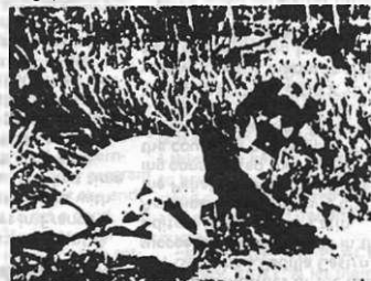
I really like the countryside!