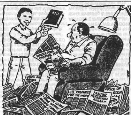
HAVE I READ THE NEWS?—OF COURSE I HAVE!—10 YEARS AGO!

(Send in your survival tips now!—Also addresses for obtaining dried foods & other survival equipment & recommended books & pamphlets on survival! Do it now! Tomorrow may be too late!)