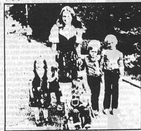
Mommy & kids on their way out singing—the pretty matching outfits are a nice ideal