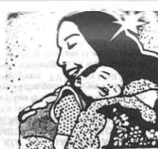
Give hail to your Queen. —Tiny baby unseen, That God from His glory did send! All Hail to the Queen! —To the mother unseen, All Hail to the mother of men! (See Letter No. 777:18.)

WE REALLY AGREE WITH THE LETTER "BLACK HOLES" (No. 726), especially the part that says Africa has had more light & that there are better Christians here than we have met in other parts of the world, especially America. The people here are simple & poor & are Christians more in deed. But they still have a battle between their traditional religions & their new-found Christianity. Demonism is rampant here. Most foreigners remark that