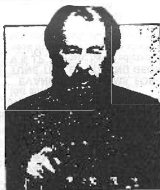
Russian exile Alexander Solzhenitsyn.

"THAT SMALL VIETNAM HAD BEEN A WARNING and an occasion to mobilize the nation's courage. But if a full-fledged America suffered a real defeat from a small communist half-country, how can the West hope to stand firm in the future? There have been naive pre-