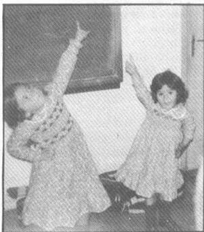
Mikol-4 and Anim-3 sing for students learning English.

Their disaster-marred history (nearly 350 medium or severe earthquakes since 1520) and sense of isolation from the rest of the world (Pacific Ocean on one side; Andes on the other) have combined to make Chileans carefree and philosophic rather than bitter, amazingly enough!