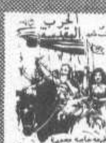
#335A Holy War