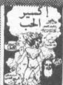
#677 Elixir of Love