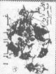
#565 Change the World