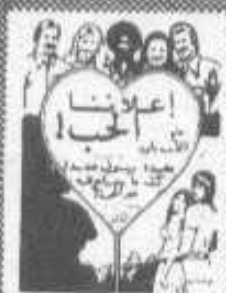
#607 Dec. of Love