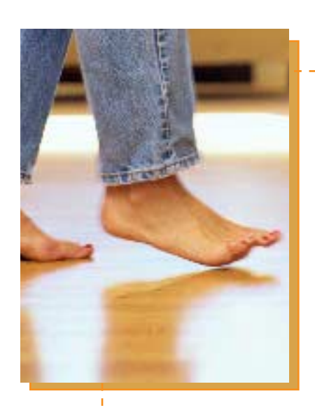
Are warts contagious?

as old ones go away. This may happen because the old warts had shed virus into the surrounding skin before they were treated. In reality new "baby" warts are growing up around the original "mother" warts. The best way to limit this is to treat new warts as quickly as they develop so they have little time to shed virus into nearby skin.