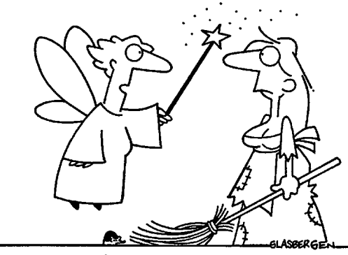
"I can change a pumpkin into a carriage, but if you want to turn fat into muscle. you'll have to exercise two hours a day."