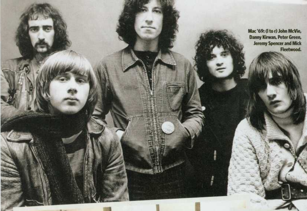
Mac '69: (l to r) John McVie, Danny Kirwan, Peter Green, Jeremy Spencer and Mick Fleetwood.

It was while attending Stafford Art College that Spencer first heard bluesman Elmore James, while listening to a blues compilation album at a friend's house. He was mesmerised the moment he first heard James's steely electric slide playing. He began to learn slide guitar. Fate helped him along when he broke a leg, and he spent the entire six weeks of convalescence absorbing and learning to imitate James's style. It became an obsession.