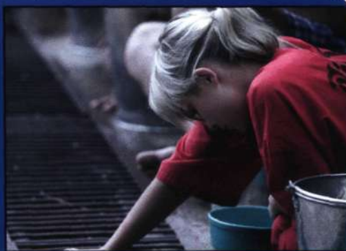
11 Rehab Thai Style