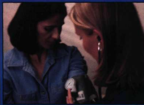
34 Blood Pressure