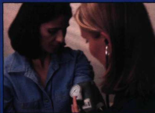
34 Blood Pressure