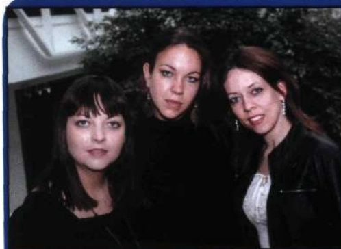
06 Not Without My Sister

Do not hand over any money until you receive the Magazine Do not buy the magazine from anyone behaving in an inappropriate fashion; begging etc