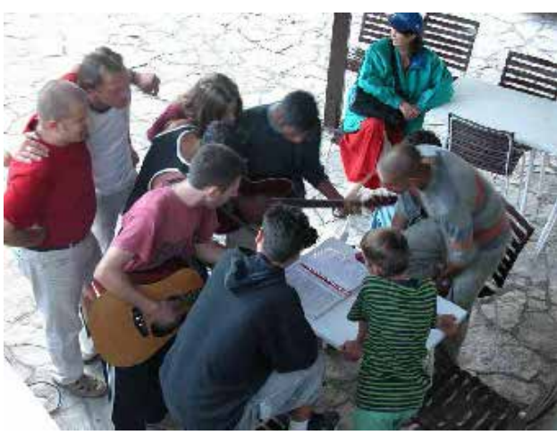
Taking advantage of a free moment to sing some songs that made the Revolution