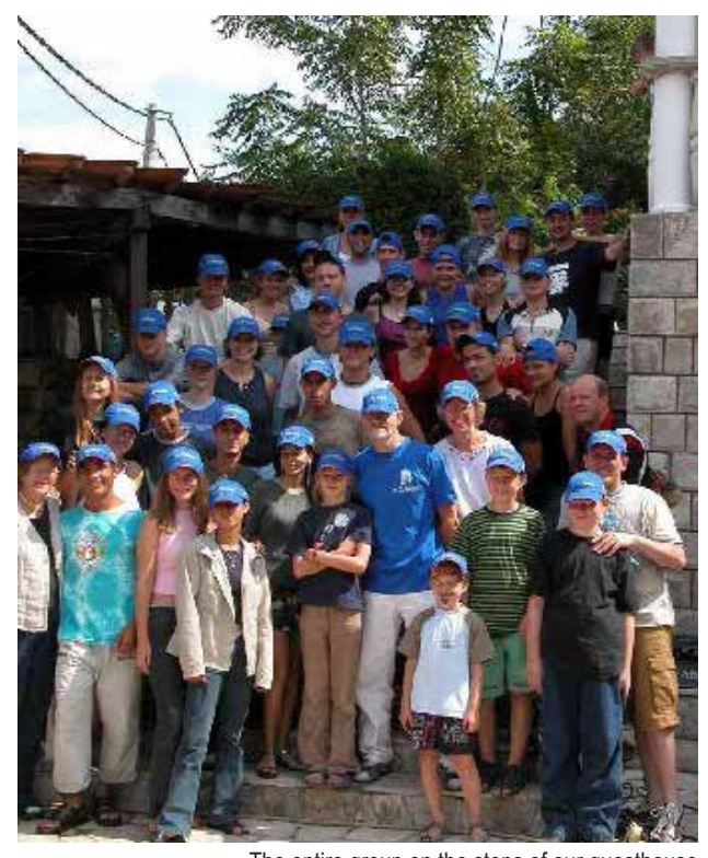
The entire group on the steps of our guesthouse